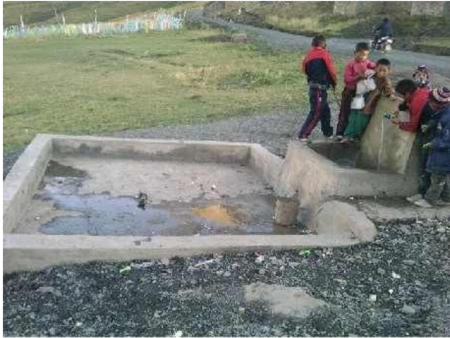
Rigul Trust funded the laying of underground piping for water from the river to reach the village and here is the evidence of the completed work with the children using the tap.