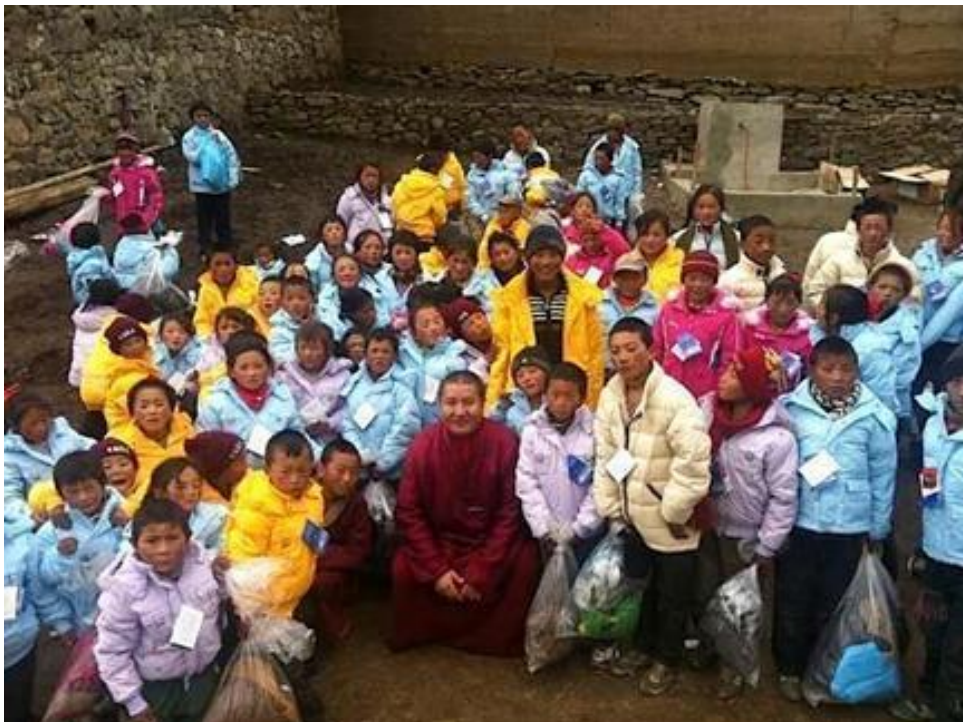
The children celebrating by the first piped water with the water tap in the background