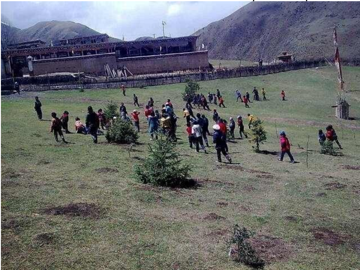
Children planting trees in Rigul

can eat. And those people who also pass out [graduated] from the school, many have joined shedra as monks; I think about 40 of them. And many others, including the girls, many girls have gone for higher studies, higher schools, middle, secondary schools elsewhere, a little bit far. So it seems the school is very helpful. Also the clinic is being used quite a lot. Lots of people come for their checkup and for medicines. So thank you very much, you and others who have contributed and helped in these projects. As you can see, we have been now helping them for a long time. Every year, around £30,000 are needed for the school and clinic. So far we have been able to make them through your generous contributions. So hopefully, we will be able to continue. Thank you very much.